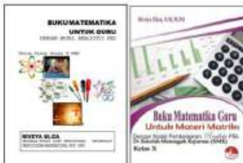
Figure 2: Mathematics book cover before and after the revision

The first revised prototype produced a second prototype. The second prototype of all product books has changed with the new book cover. One example can be seen in Figure 2.