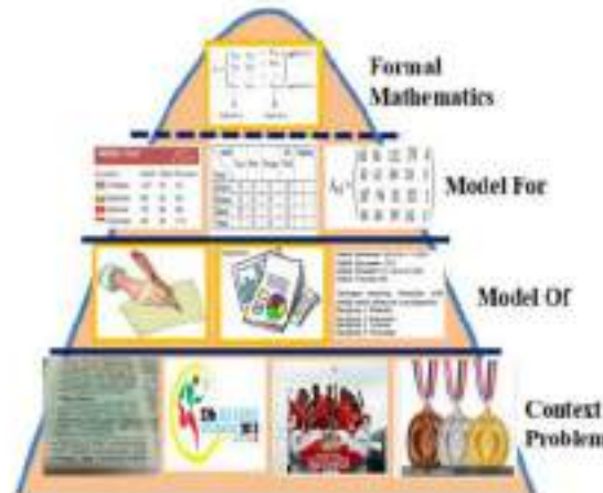
Figure 1. Joeborg to find the concept of the matrix

In the teacher's book, it is advisable to package the learning by building a solid foundation of knowledge first, so it makes easier to build up the knowledge on it until it reaches the formal mathematical stage (Joeborg-Formal Mathematics). One example that can be seen is in Figure 1.